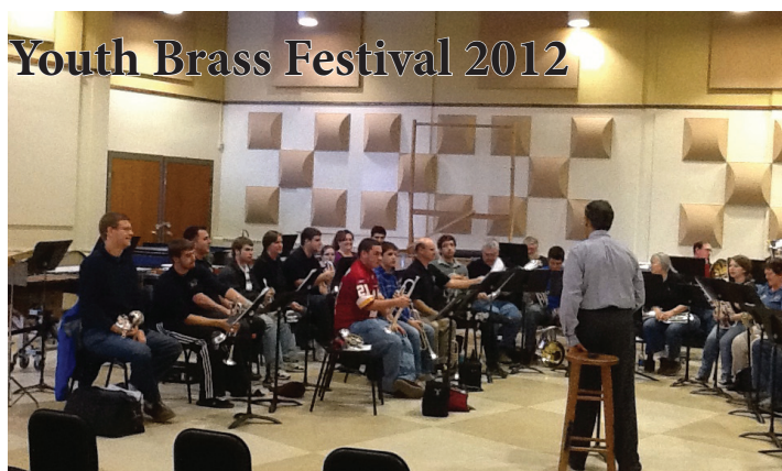
Youth Brass Festival 2012